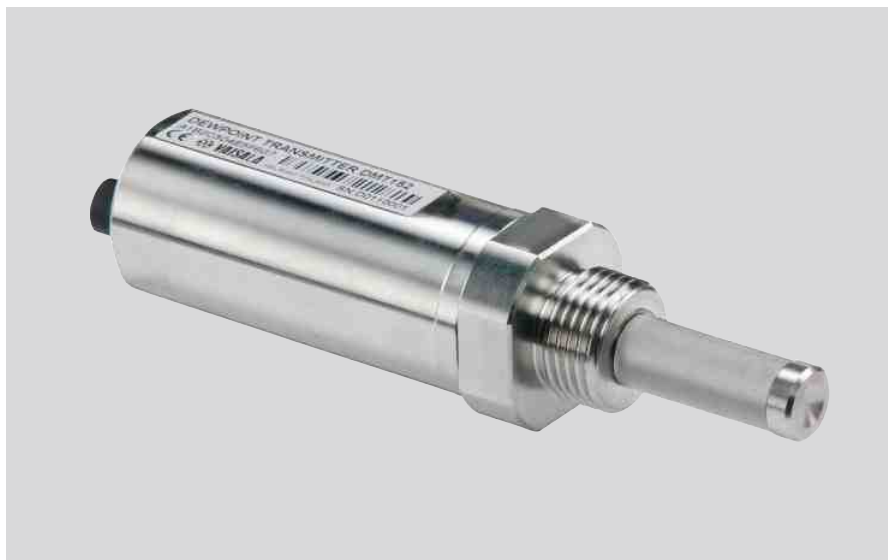
The small and powerful DMT152 measures dew point down to -80 °C.