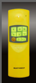
NRM800 Remote Control