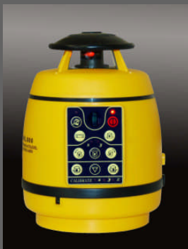
NRL800 Self-Leveling Rotating Laser

Self-Leveling in Both Horizontal and Vertical Po- sitions