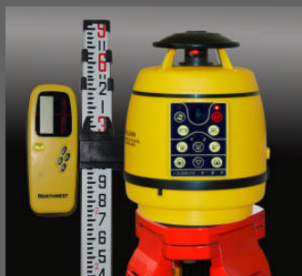
NEXPK800 Exterior Package

Specifications Subject to Change Without Notice