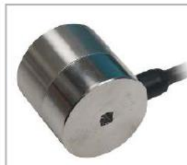
^ Female square drive