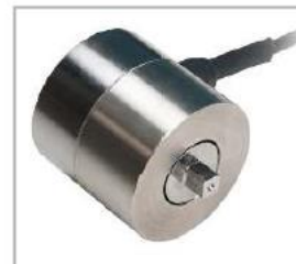
^ Male square drive